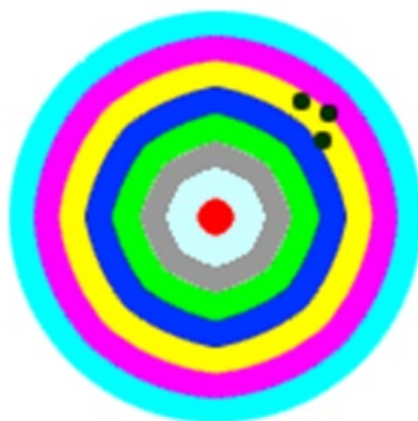
Precise, but not accurate