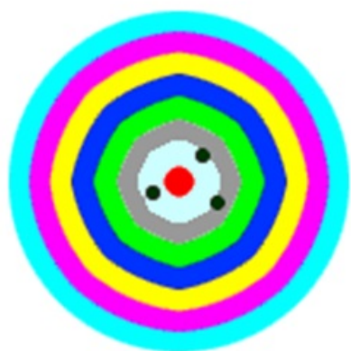
Accurate, but not very precise

The mean value for the LLOQ (lowest concentration with >5:1 signal to noise) should be within 20 percent. (80% - 120% of the true value)